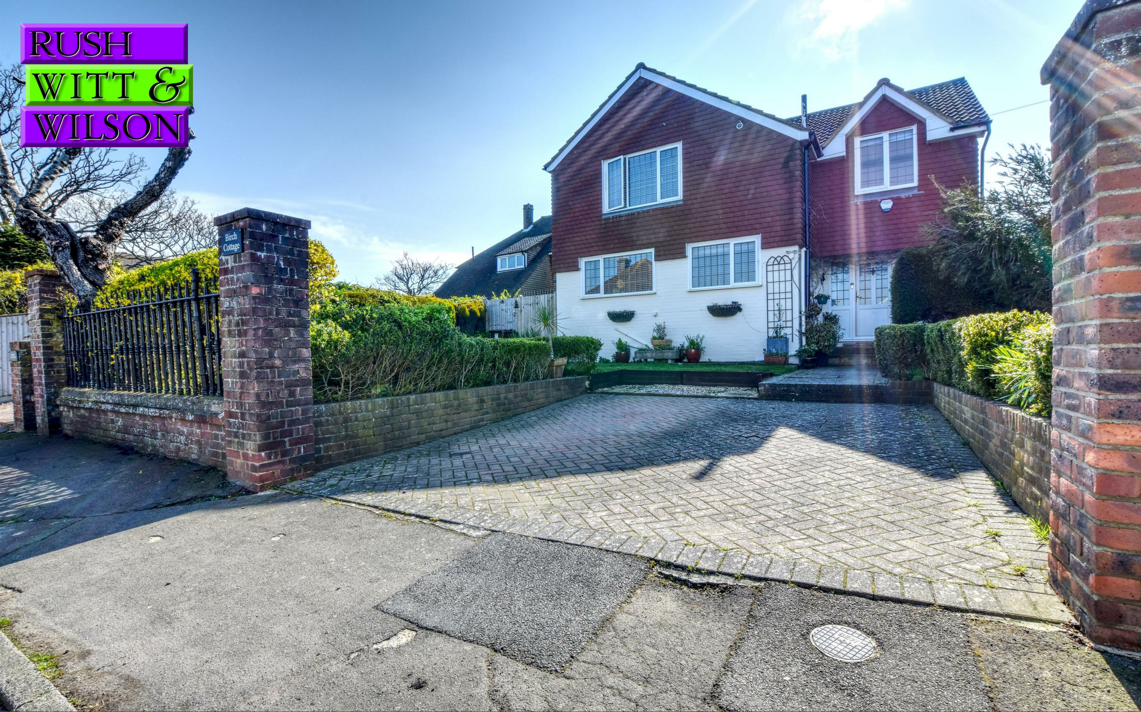
Birch Cottage St. Johns Road, Bexhill-On-Sea, East Sussex TN40 2EF £575,000